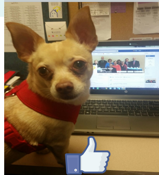
Milo, Pearl's Chihuahua mix, browses the CVL page and reminds people to Like Us on Facebook.

Of course! I am not going anywhere any time soon and plan to make myself available should my schedule allow it.