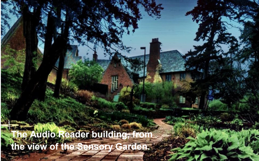
The Audio Reader building, from the view of the Sensory Garden.

Recently, at an ADA Celebration, one of the speakers observed if you look around at a gathering of people, disability is the norm. In any group there are more people experiencing a disability or limitation than those that are not. She noted that we are really all “temporarily able”. At some point in almost every person’s life they will experience limitations. It might a temporary limitation due to surgery, a gradual loss of function due to the normal aging process or the result of an accident but rarely will you make it through a lifetime unscathed.