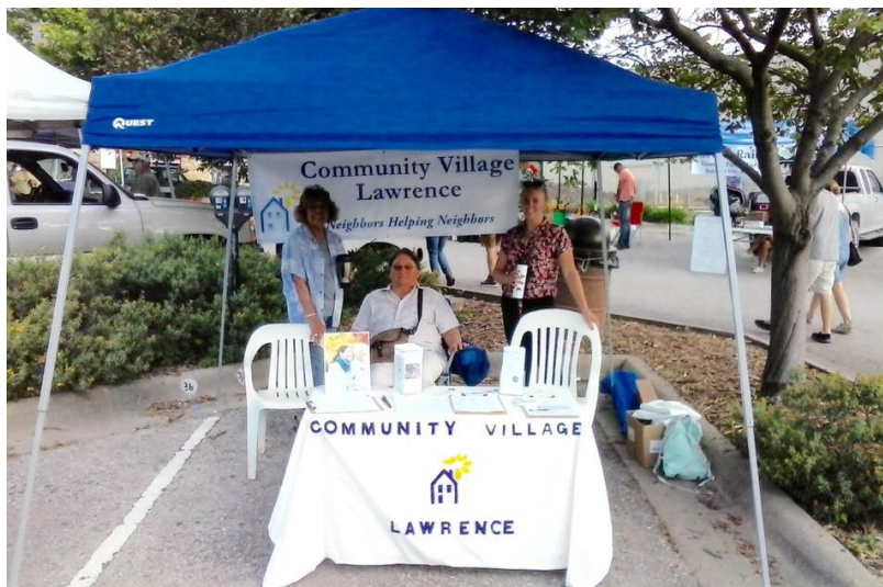
Reaching new community members on a Saturday morning at the Lawrence Farmer's Market.